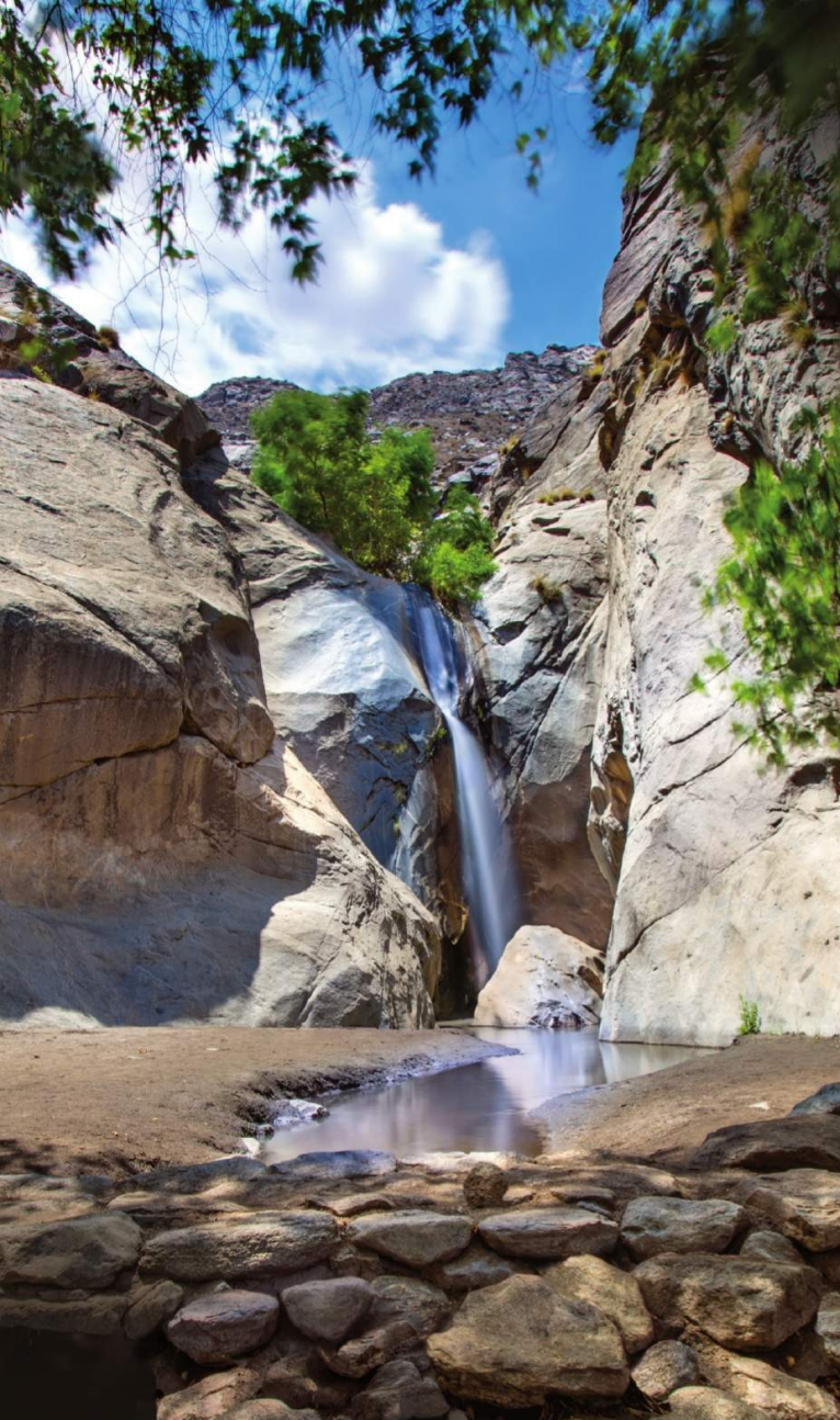
LEFT: Tahquitz Falls in Tahquitz Canyon. OPPOSITE: Indian Canyons.

Caliente Band of Cahuilla Indians, or Fifth People, the names of indigenous animals in a song. Cahuilla clans were named after some of these animals and helped differentiate the clans.