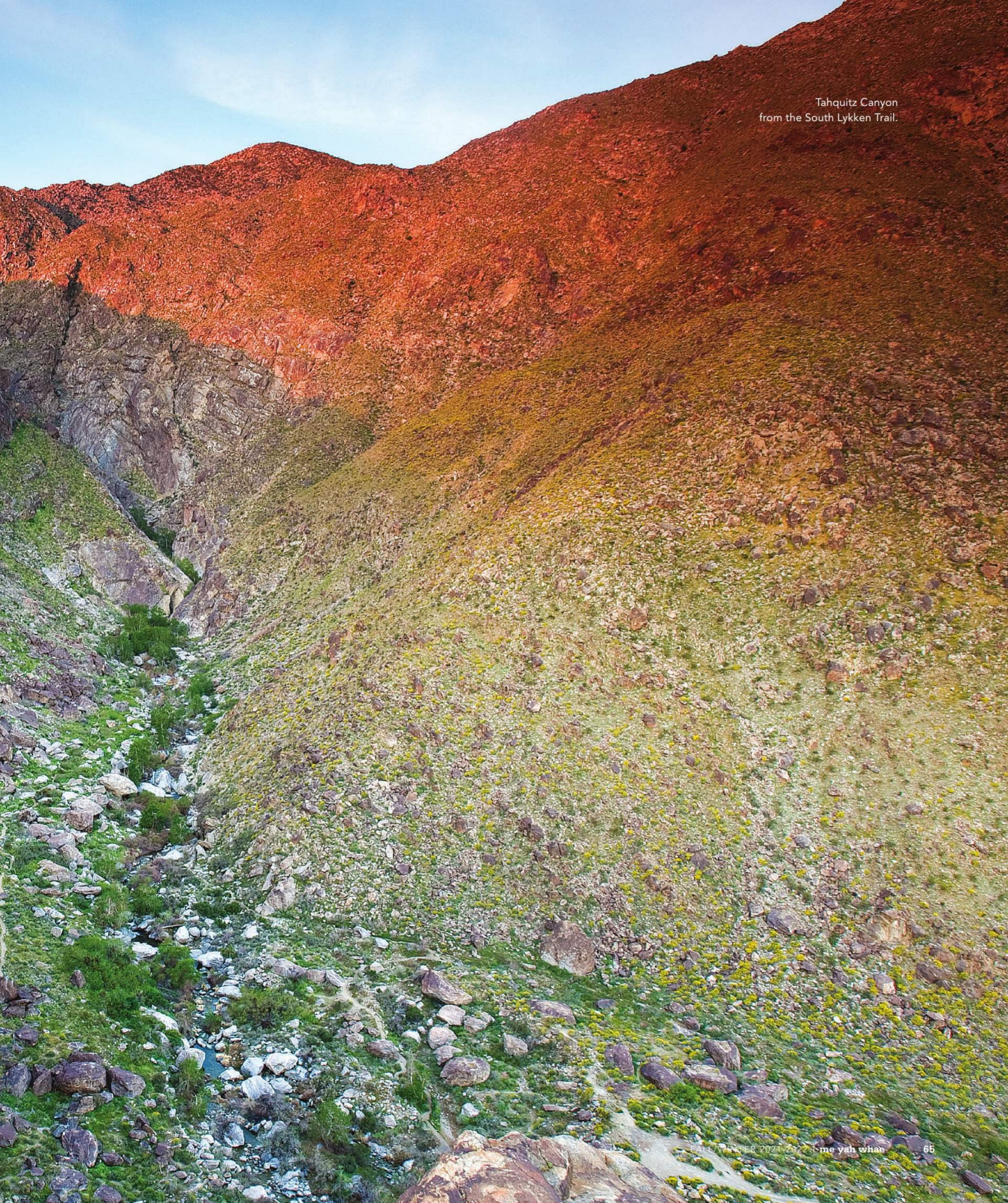
Tahquitz Canyon from the South Lykken Trail.